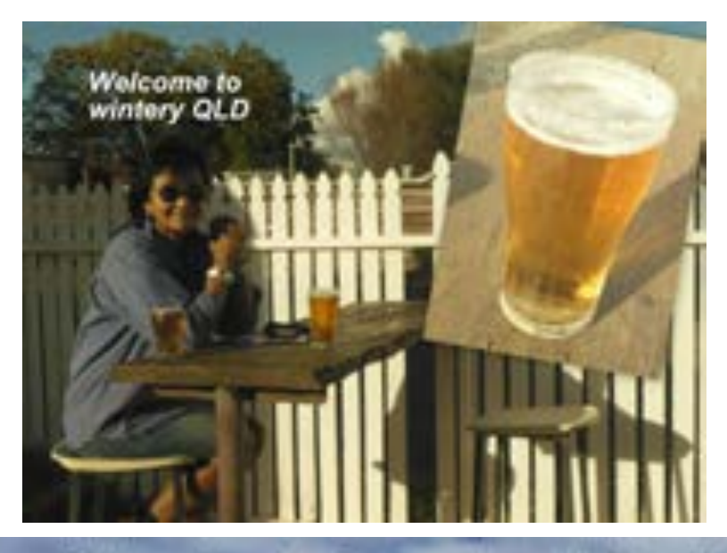
Time for a calming ale!